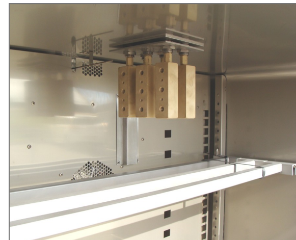
View inside heating oven - optional manifolds (access ports) for connecting pipe samples in case connection to pressure testing equipment is needed. Further, the optional sample hanging bars are shown (three pieces in picture above) for hanging pipe samples.